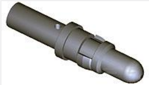
TE Part #212007-1 CONTACT PIN ASSY, SZ 8