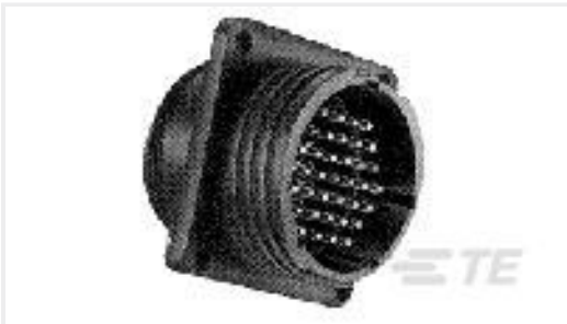
TE Part #206838-3 CPC RECPT SEALED SIZE 23-24