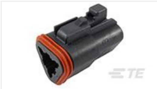
TE Part #DT06-3S-E004 PLG, 3P, BLK, N