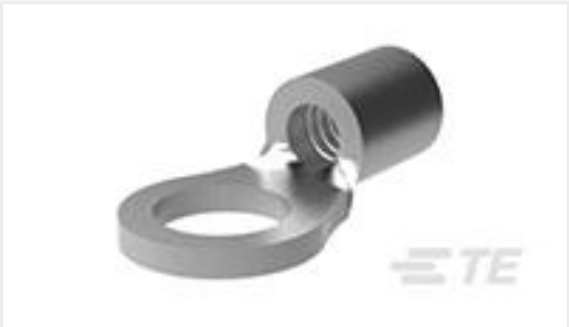
TE Part #35665 TERMINAL,SOLIS R 8 5/8