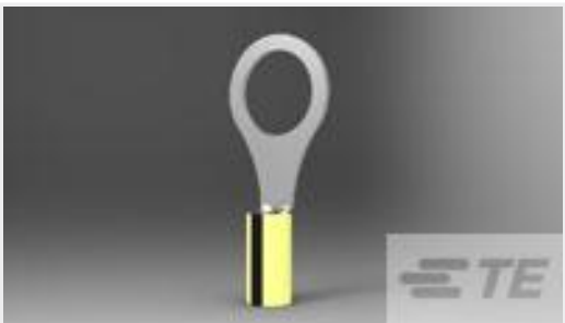
TE Part #330896 TERMINAL,PIDG R 16-14HD 3/8