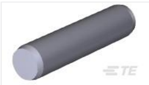
TE Part #201501-1 SPIROL PIN