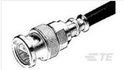
TE Part #5332225-5 PLUG, TWIN BNC,