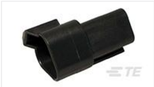
TE Part #DT04-3P-E004 REC, 3P, BLK, N