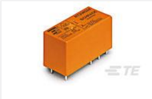
TE Part #3-1393239-6 RT174005