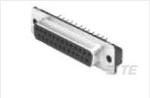
TE Part #5747150-7 09 RCPT SP/FMS INSRT