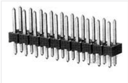
TE Part #5-146253-4 08 MODII HDR DRST B/A .100CL LF