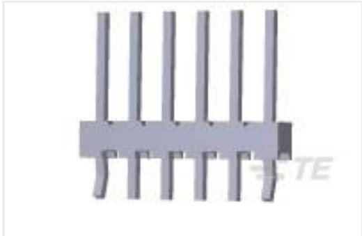
TE Part #3-644695-6 06P MTA100 STR HDR RETENTIVE