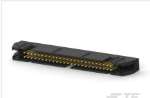
TE Part #CAT-AM74-UN384H AMP-LATCH UNIVERSAL HEADERS