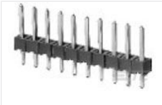
TE Part #5-146278-4 04 MODII HDR SRST B/A .100CL