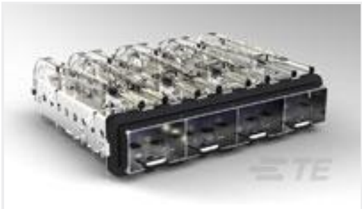
TE Part #2110570-1 SFP+ 1x4 Cage Assembly Square Light Pipe