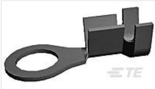
TE Part #160101-9 RING TONGUE 20-16 AWG 0.0253 NPBR