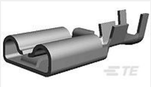
TE Part #175020-1 250 PL EX REC. 22-18AWG PTBR