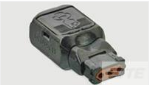
TE Part #D369-P33-NP0 369 3 WAY PLUG, NO CONTACTS, PIN