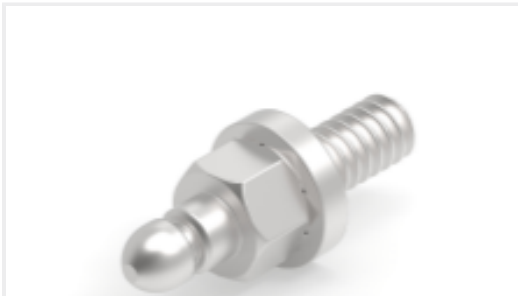
TE Part #1-2308265-4 QL SET FOR VARIANT B 4