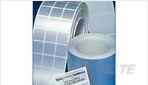
TE Part #D74058-000 WP-101165-0.85-9