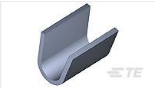
TE Part #63130-3 SPLICE REC. 1500-5000 .020 TPBR