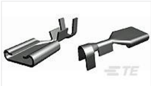
TE Part #61202-1 250 FASTON REC 26-22 AWG BR