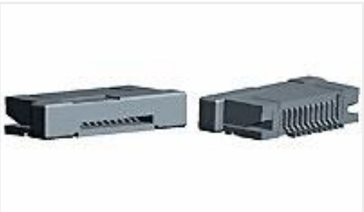
TE Part #2-1734592-0 FPC CONN. 0.5MM PITCH B/C, 20P