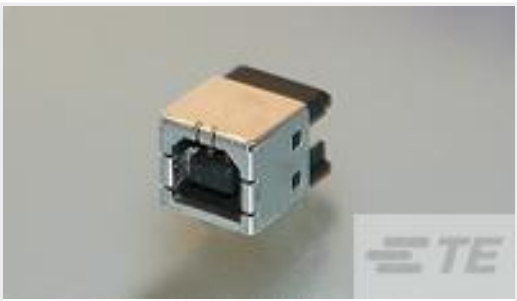
TE Part #1734346-1 STD USB TYPE B, R/A, SMT