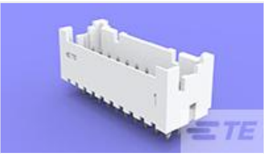
TE Part #1-1969543-4 ASSY, HDR, VERT, BOSSED, DUAL ROW, EP2.5