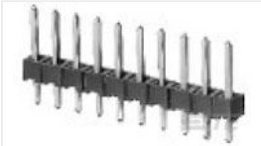
TE Part #5-146278-5 05 MODII HDR SRST B/A .100CL