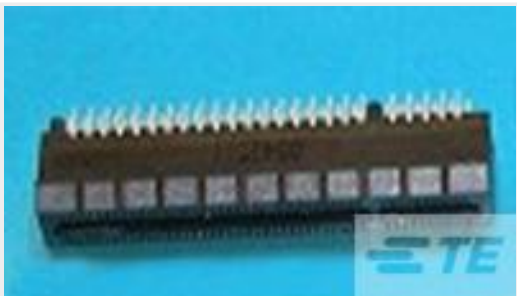
TE Part #5650118-3 CONN SEC II 6 POS 100C/L R/A