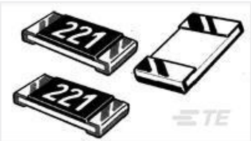
TE Part #2176070-4 3521 13R 1% 2W