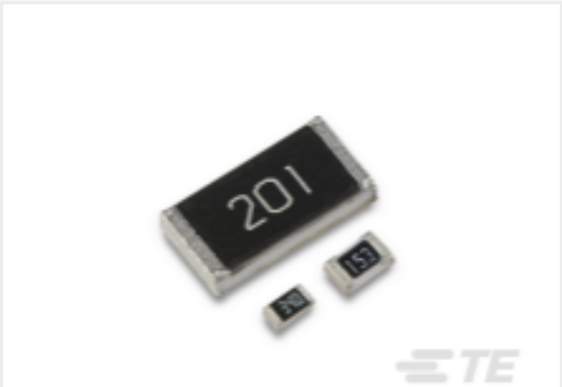
TE Part #1-2176328-6 CRGP 1206 180R 1%