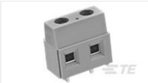
TE Part #796740-2 2 POS PCB MT 6.35MM HI CRT TBK