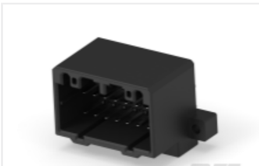
TE Part #9-1456610-2 16P 040 VERT HYBRID CAP ASSY