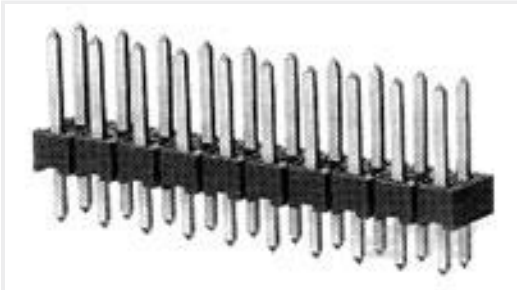
TE Part #5-146256-4 08 MODII HDR DRST B/A .100CL LF