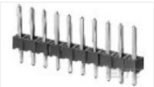
TE Part #5-146281-5 05 MODII HDR SRST B/A LF