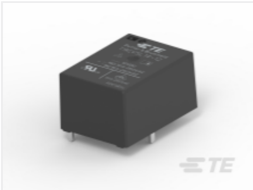
TE Part #1558666-3 T9GS1L14-12