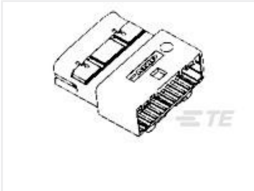
TE Part #1473203-1 025 CAP ASSY 16P P/BACK BRCKT