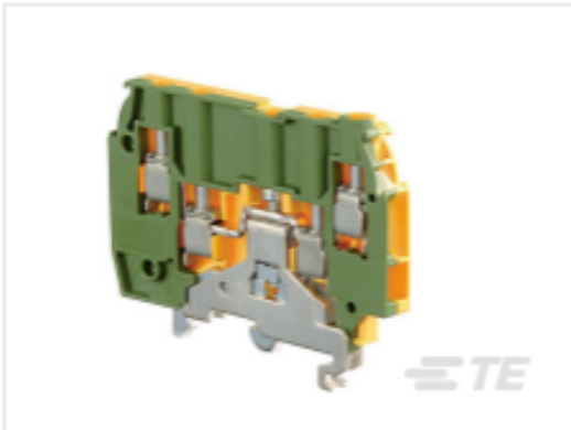
TE Part #1SNA195638R2300 M4/6.4A.P