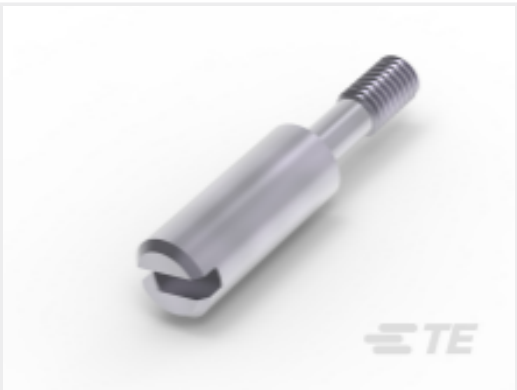
TE Part #T0931003003-000 CODING-PIN-M3