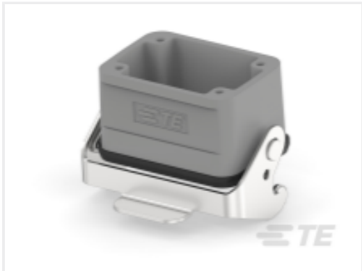
TE Part #T1730060000-000 H6B-TBF-T