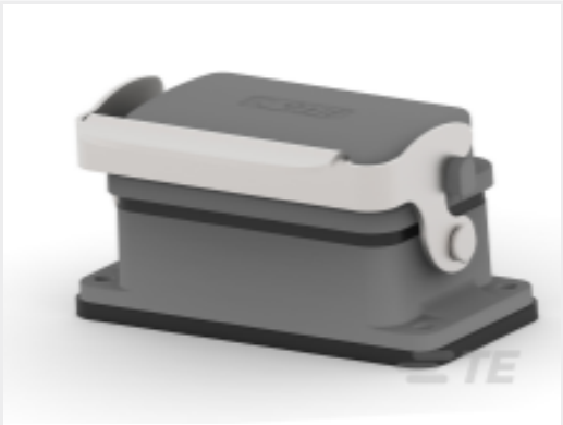
TE Part #T2120100220-000 ZGGP-H10BSK 1-7/2-8/3-9/4-6/5-10