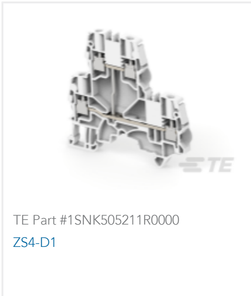
TE Part #1SNK505211R0000 ZS4-D1