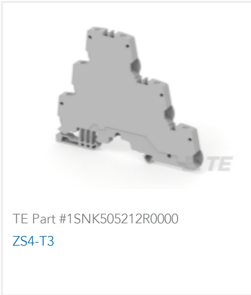
TE Part #1SNK505212R0000 ZS4-T3