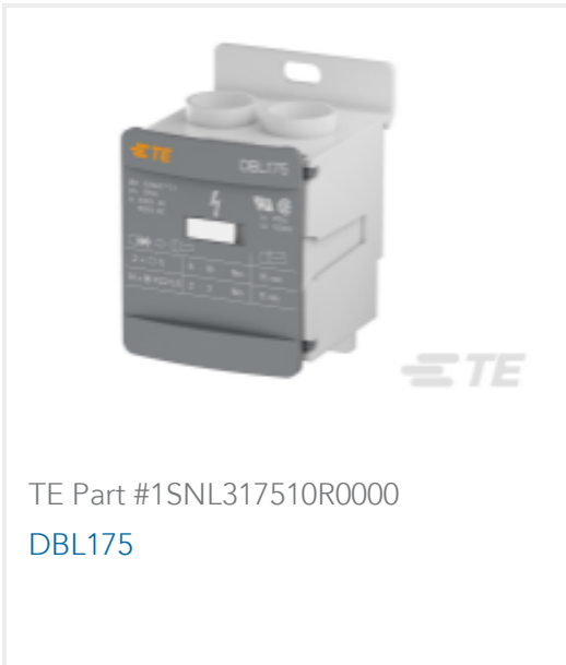
TE Part #1SNL317510R0000 DBL175