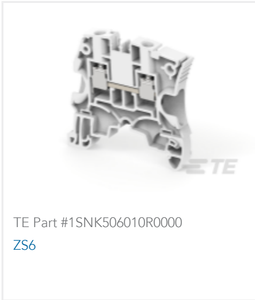
TE Part #1SNK506010R0000 ZS6