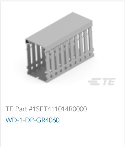
TE Part #1SET411014R0000 WD-1-DP-GR4060