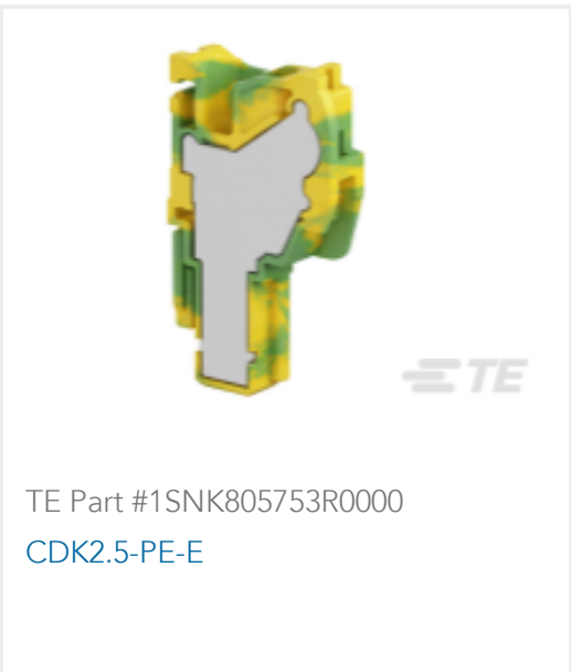
TE Part #1SNK805753R0000 CDK2.5-PE-E