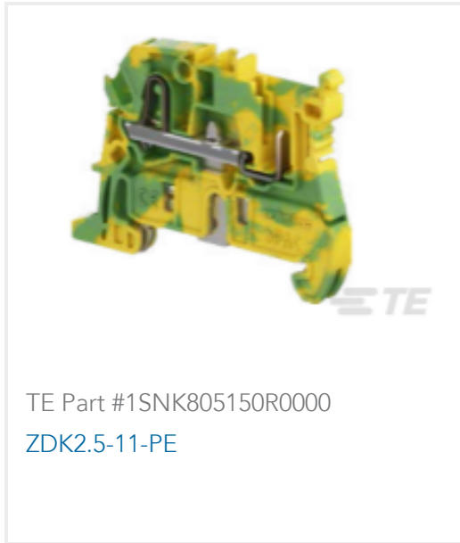
TE Part #1SNK805150R0000 ZDK2.5-11-PE