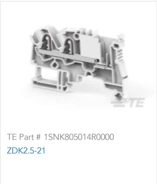
TE Part # 1SNK805014R0000 ZDK2.5-21