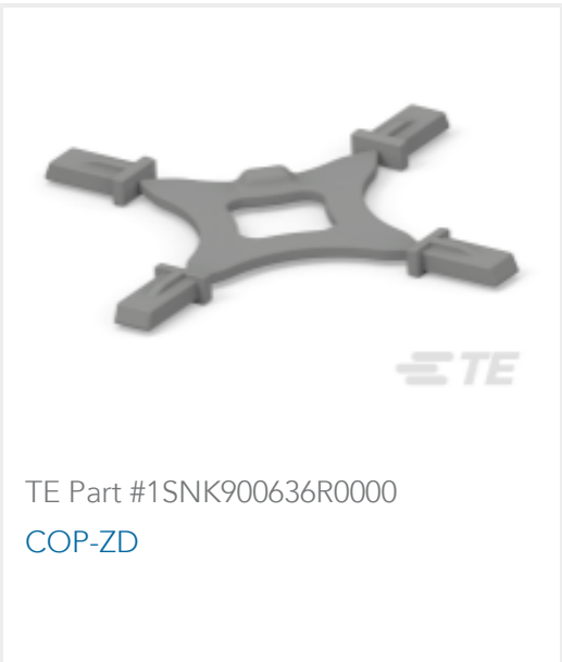
TE Part #1SNK900636R0000 COP-ZD