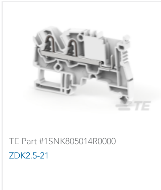
TE Part #1SNK805014R0000 ZDK2.5-21