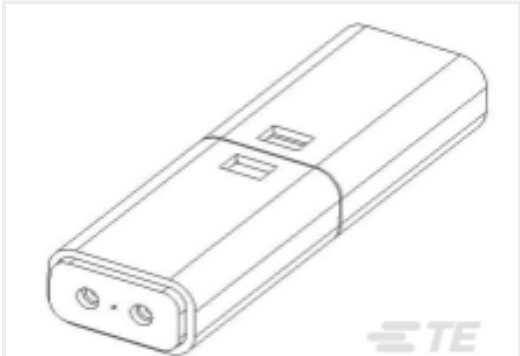
TE Part #65053-208 ELEC MODULE