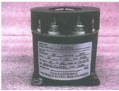
TE Part #1616103-2 DH7MN (FAA/PMA)=RELAY