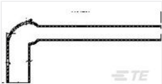
TE Part #813945-000 222A313-3-0