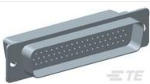
TE Part #2101497-5 AMPLIMITE KIT, PLUG, W/IF+GMT, Sz5, 90