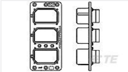
TE Part #1218358-1 RME3P88S106S106S-0001(400)