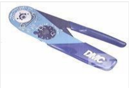
TE Part # 601966-1 CRIMPING TOOL M22520/2-01