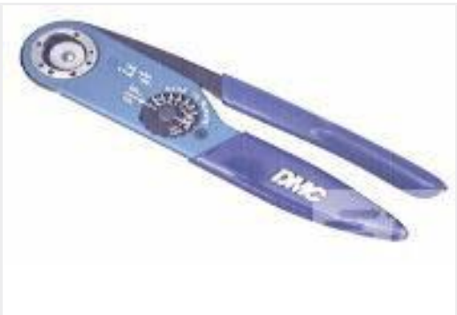
TE Part # 601967-1 CRIMPING TOOL M22520/1-01

This information is provided based on reasonable inquiry of our suppliers and represents our current actual knowledge based on the information they provided. This information is subject to change. The part numbers that TE has identified as EU RoHS compliant have a maximum concentration of 0.1% by weight in homogenous materials for lead, hexavalent chromium, mercury, PBB, PBDE, DBP, BBP, DEHP, DIBP, and 0.01% for cadmium, or qualify for an exemption to these limits as defined in the Annexes of Directive 2011/65/EU (RoHS2). Finished electrical and electronic equipment products will be CE marked as required by Directive 2011/65/EU. Components may not be CE marked. Additionally, the part numbers that TE has identified as EU ELV compliant have a maximum concentration of 0.1% by weight in homogenous materials for lead, hexavalent chromium, and mercury, and 0.01% for cadmium, or qualify for an exemption to these limits as defined in the Annexes of Directive 2000/53/EC (ELV). Regarding the REACH Regulation, the information TE provides on SVHC in articles for this part number is based on the latest European Chemicals Agency (ECHA) 'Guidance on requirements for substances in articles' posted at this URL: https://echa.europa.eu/guidance-documents/guidance-on-reach