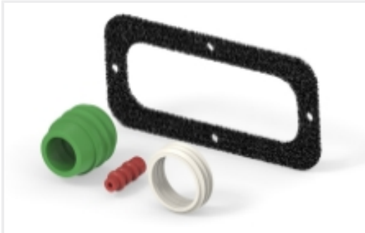
Connector Seals & Cavity Plugs(4)