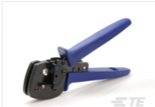
TE Part # 1-2823557-1 CRIMP TOOL FOR CRIMP FLANGE /SLEEVE