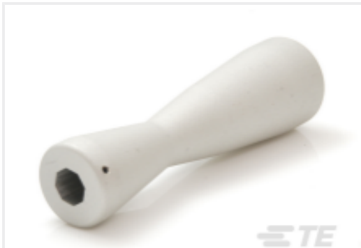
TE Part # 1-2823560-1 ASSEMBLY TOOL HANDLE FOR CRIMP FLANGE