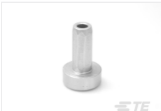
TE Part # 1-2823561-1 UNIVERSAL INSERT (ALL M12 CODES)