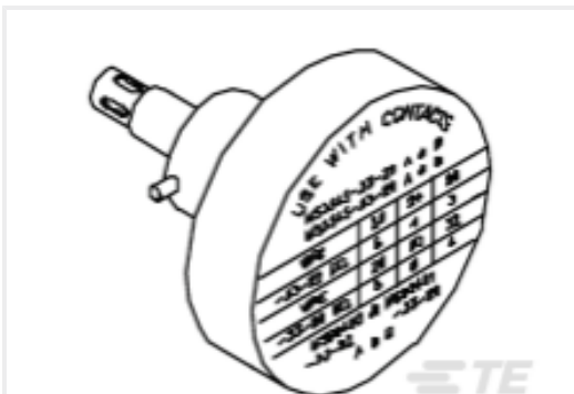
TE Part # CAT-M1-M1 M12 Assembly Tooling