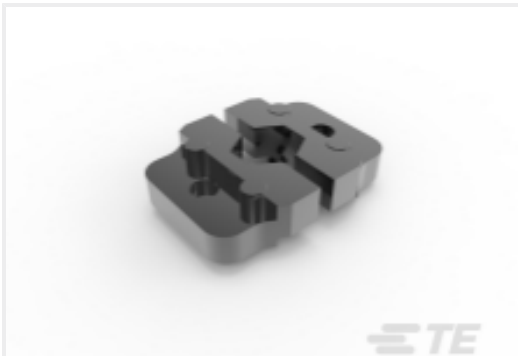
TE Part # CAT-R131-IN722 Crimp Insert for Use with 1-2823557-1