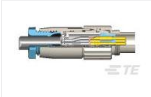
TE Part #2-1437719-4 T01-0550-P07-MALE PULG CONNECTOR SOLDER