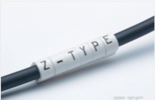
TE Part #EC0052-000 05801912