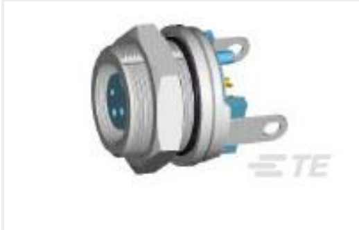
TE Part #9-1437719-9 T01-0580-S04-FEMALE REC PANEL MNT SOLDER