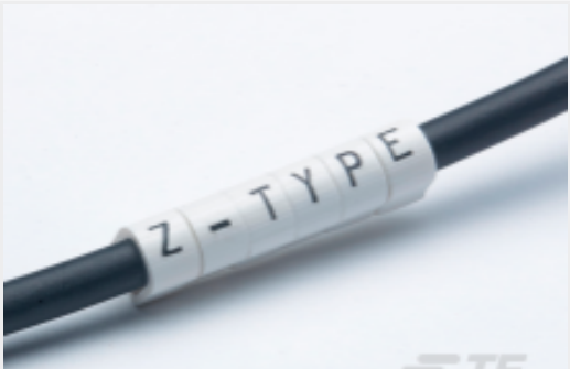
TE Part #EC0050-000 05801910