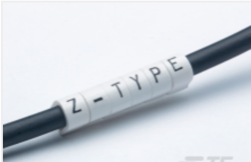
TE Part #EC0076-000 05801936