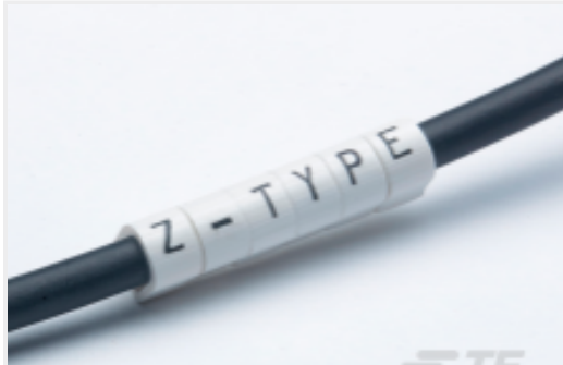
TE Part #EC0054-000 05801914