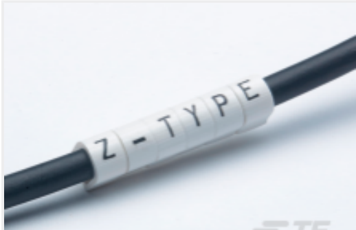
TE Part #EC0077-000 05801937