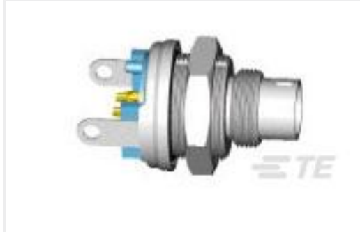
TE Part #8-1437719-4 T01-0580-P04-MALE REC PANEL MOUNT SOLDER