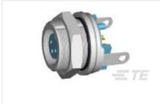
TE Part #1437720-6 T01-0580-S07-FEMALE REC PANEL MNT SOLDER