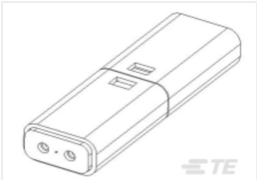
TE Part #65053-208 ELEC MODULE