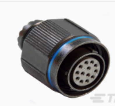
TE Part #YDTS26F15-97JNV001 PLUG ASSY