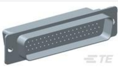
TE Part #2101497-5 AMPLIMITE KIT,PLUG,W/IF+GMT,Sz5,90