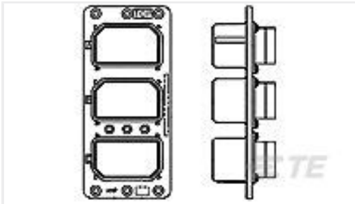
TE Part #1218358-1 RME3P88S106S106S-0001(400)