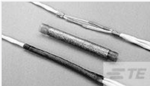
TE Part #748703-000 B-500-02-105