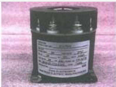
TE Part #1616103-2 DH7MN (FAA/PMA)=RELAY