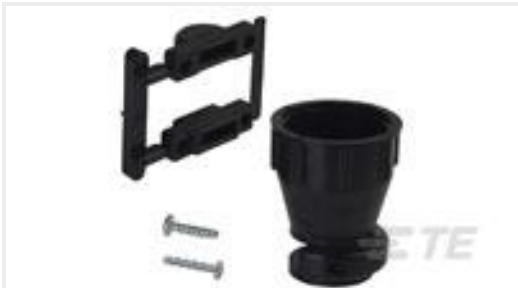
TE Part #206070-8 CABLE CLAMP KIT #17