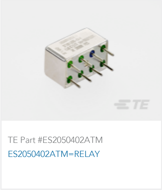
TE Part #ES2050402ATM ES2050402ATM=RELAY