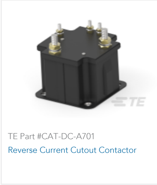
TE Part #CAT-DC-A701 Reverse Current Cutout Contactor