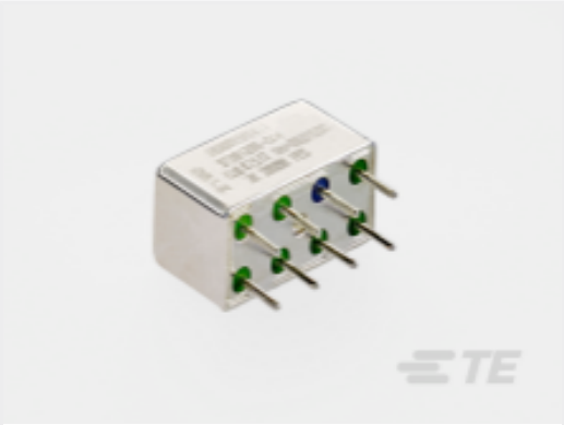
TE Part #ES2100403CTM ES2100403CTM=RELAY