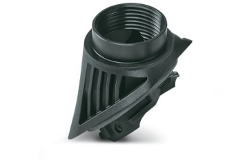
Plastic thread adapter with bayonet lock, for EVO housing series B, Pg21 thread

Please be informed that the data shown in this PDF document is generated from our online catalog. Please find the complete data in the user documentation. Our general terms of use for downloads are valid.