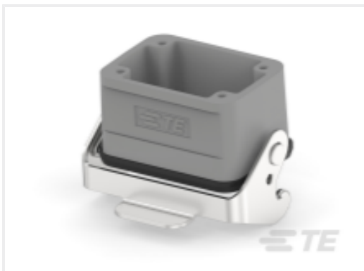
TE Part #T1730060000-000 H6B-TBF-T