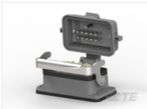
TE Part #T2120100219-000 ZGG-10DSTK,1-7,2-8,3-9,4-6,5-10