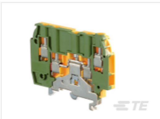
TE Part #1SNA195638R2300 M4/6.4A.P