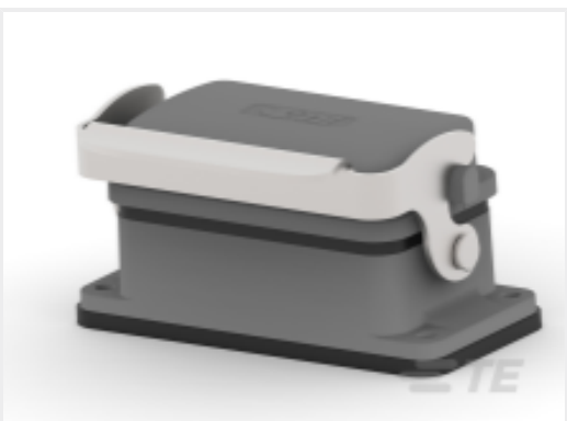
TE Part #T2120100220-000 ZGGP-H10BSK 1-7/2-8/3-9/4-6/5-10