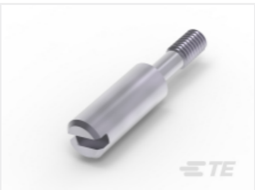
TE Part #T0931003003-000 CODING-PIN-M3