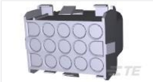
TE Part #1-480711-9 15P UMNLCAP HSG BLK