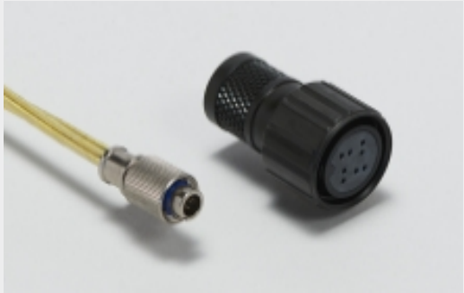
Standard Circular Connectors(106)