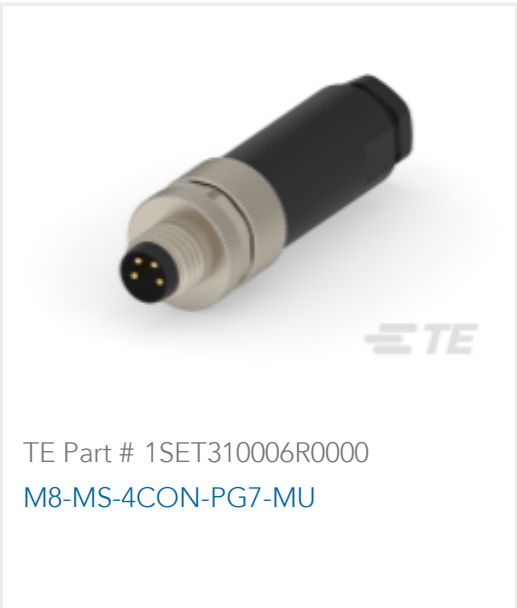
TE Part # 1SET310006R0000 M8-MS-4CON-PG7-MU