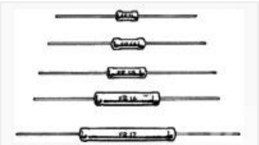
TE Part #2-1623750-7 ER58 4R7 5% AMMO