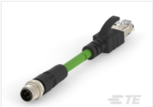
TE Part #TCD14741111-001 M12D4-MS-RJ-PVC-22SH-TYPE B GREEN-0.5M