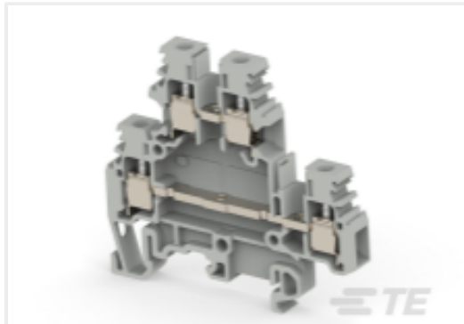
TE Part #1SNA115271R2200 M4/6.D2