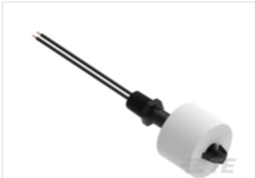
TE Part #83012-000 VCS-04 Level Switch, M8x1.25, Water