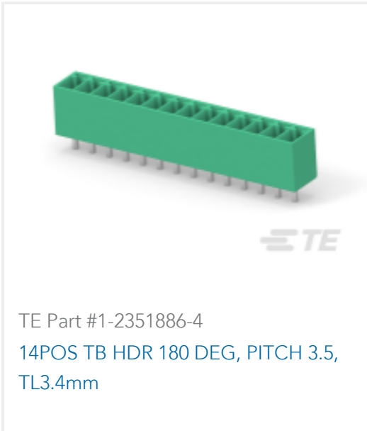
TE Part #1-2351886-4 14POS TB HDR 180 DEG, PITCH 3.5, TL3.4mm

5POS TB HDR 180 DEG, PITCH 3.5, TL 3.4mm