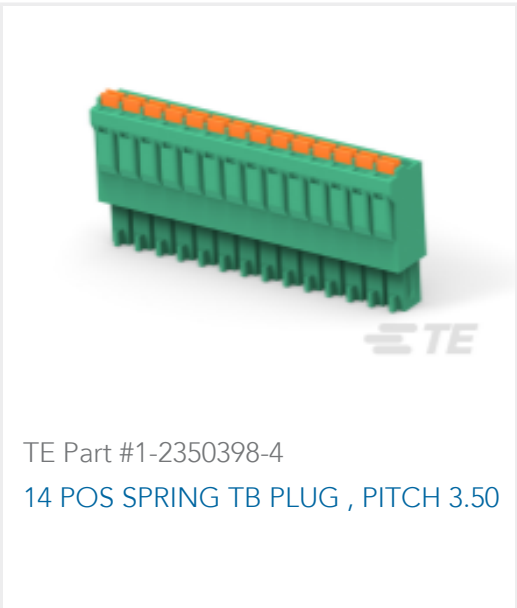
TE Part #1-2350398-4 14 POS SPRING TB PLUG , PITCH 3.50