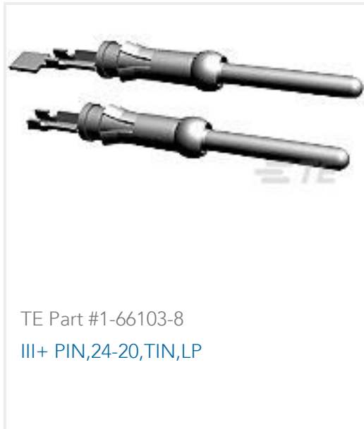
TE Part #1-66103-8 III+ PIN,24-20,TIN,LP