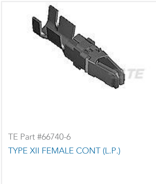
TE Part #66740-6 TYPE XII FEMALE CONT (L.P.)