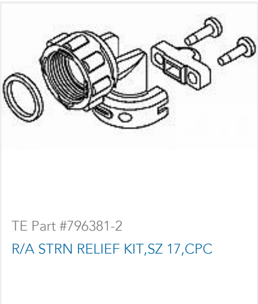
TE Part #796381-2 R/A STRN RELIEF KIT,SZ 17,CPC