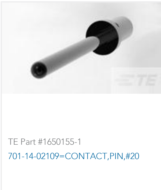
TE Part #1650155-1 701-14-02109=CONTACT,PIN,#20

Product Drawings CONNECTOR,SOCKET,SQUARE DRAWER English