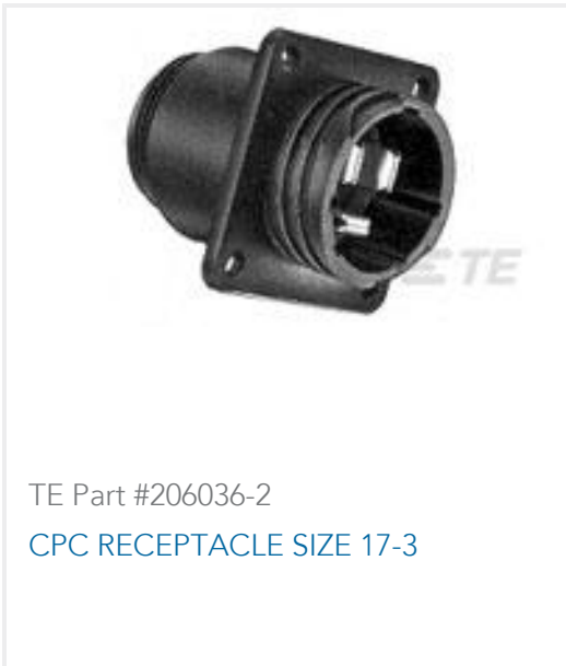
TE Part #206036-2 CPC RECEPTACLE SIZE 17-3