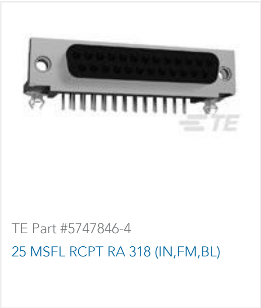
TE Part #5747846-4 25 MSFL RCPT RA 318 (IN,FM,BL)