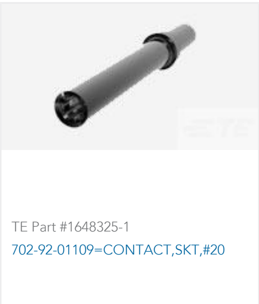
TE Part #1648325-1 702-92-01109=CONTACT,SKT,#20