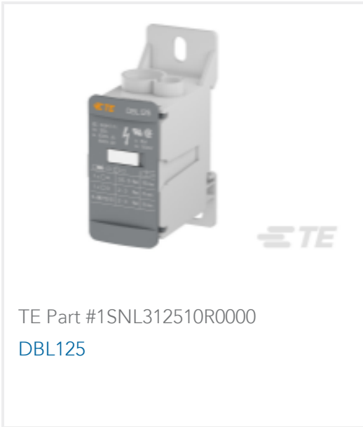
TE Part #1SNL312510R0000 DBL125