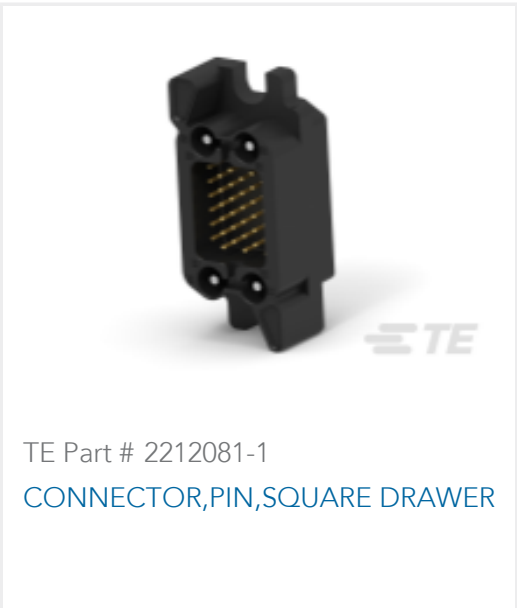
TE Part # 2212081-1 CONNECTOR,PIN,SQUARE DRAWER