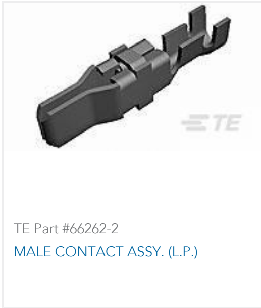
TE Part #66262-2 MALE CONTACT ASSY. (L.P.)