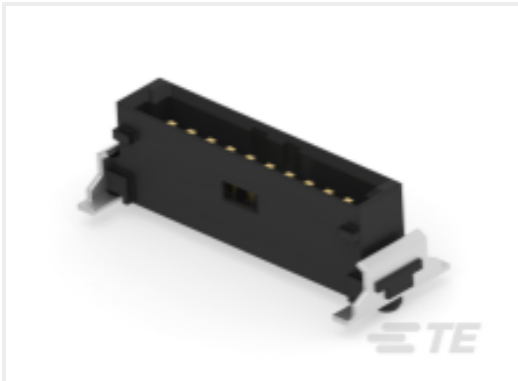
TE Part #294919-E SRCP 1,27 10 M 1 SMD 137 E1 094 * GU-H *