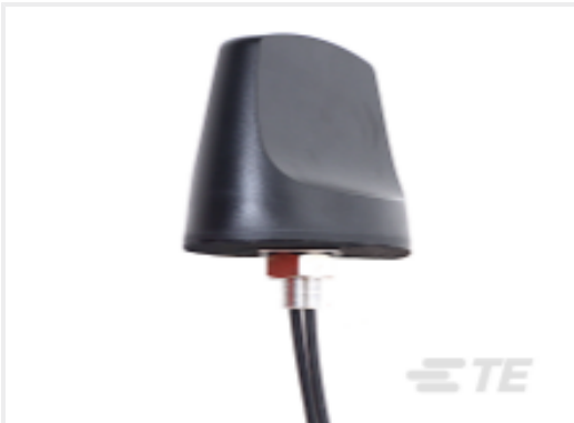
TE Part #MTRA61274CB2-001 OMNI,DB,Ph,617/1690 MHz