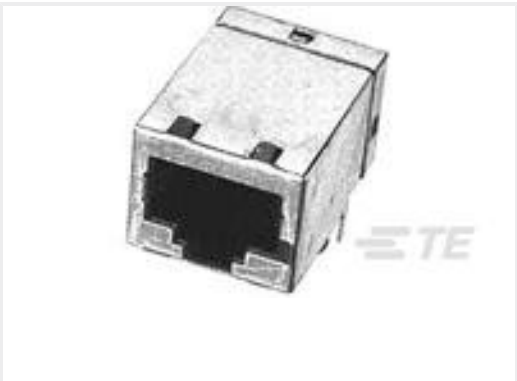
TE Part #5557789-1 MJ,8POS,R/A,SHORTNG,PCBG