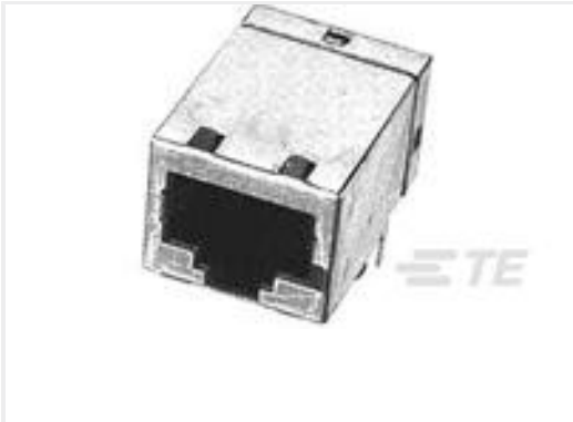
TE Part #5557786-1 MJ,8POS,R/A,SHLD,PCB GD