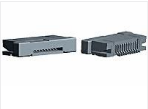
TE Part #1734592-8 FPC CONN. 0.5MM PITCH B/C, 8P

M12 R/A F PNL STAMPED PIN A-CODE 2P SHLD