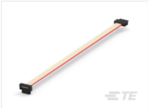
TE Part #839686-E IDCCS SRC 1,27 6 * SFX APU 160 PVC