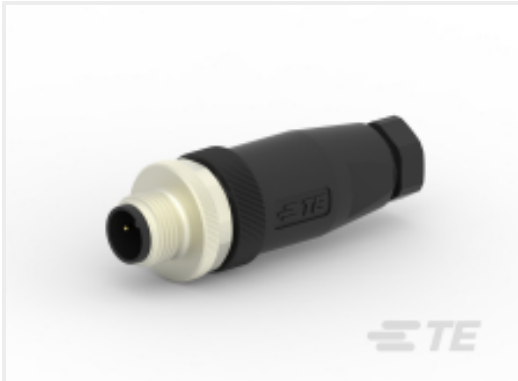
TE Part #T4111001021-000 M12,MALE,STRAIGHT,A CODE,2P, PG7,GOLD