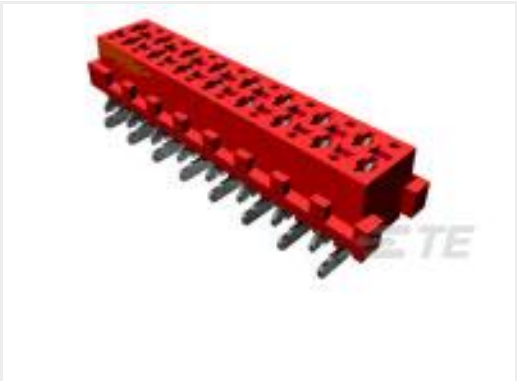
TE Part #1-188275-4 MICRO-MATCH SMD FTE