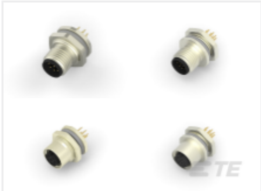
TE Part #CAT-C73765-M1H M12 Panel Mount PCB