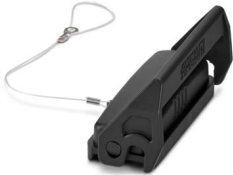
Protective cover D25, with single locking latch, protective cover material: PC, height: 15.5 mm, seal: no

Please be informed that the data shown in this PDF document is generated from our online catalog. Please find the complete data in the user documentation. Our general terms of use for downloads are valid.