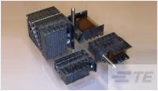
TE Part # 2007711-1 IMP100S,R,RA3P16C,UG,39