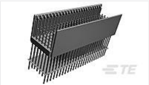
TE Part #5352869-1 2MMHM ASY,TYPE B 133 POS