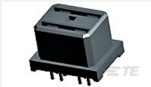
TE Part #2169806-1 IMP,Power,3PR,Vert,Recp,Tin