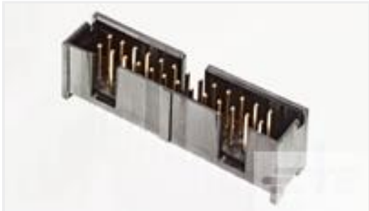
TE Part #5103308-2 A/L LOW PRO HDR 14P VERT BLACK