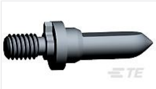
TE Part #2000676-1 Keyed Guide Pin, Machined, Vita 46