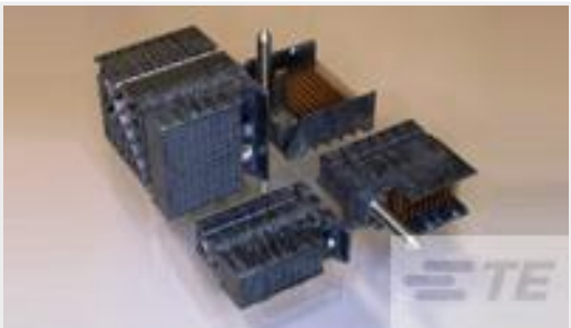
TE Part #2007717-1 IMP100S,R,RA4P10C,UG,39