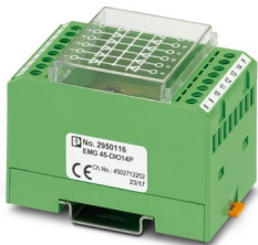
Diode module, for extension with 14 1N 4007 diodes, with a common cathode

Please be informed that the data shown in this PDF document is generated from our online catalog. Please find the complete data in the user documentation. Our general terms of use for downloads are valid.