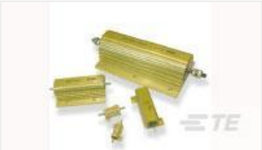
TE Part #9-1625984-0 HSA50 R05 5%