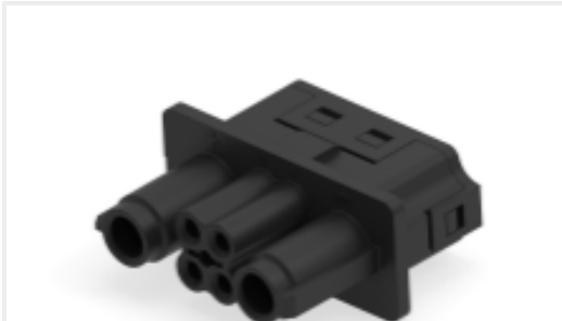
TE Part #T2120062201-001 HK2/4-006-F