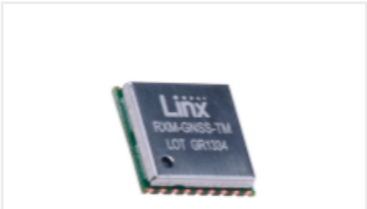
TE Part #RXM-GNSS-TM-T Module TM L1 GNSS RX RCVR T&R