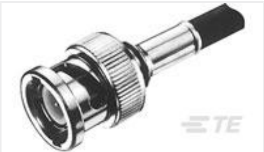
TE Part #5227079-5 COMM BNC PLUG