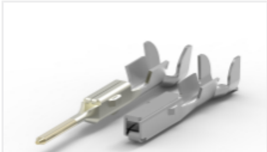
TE Part #CAT-M9194-T273 MULTILOCK, RECEPTACLE AND TAB