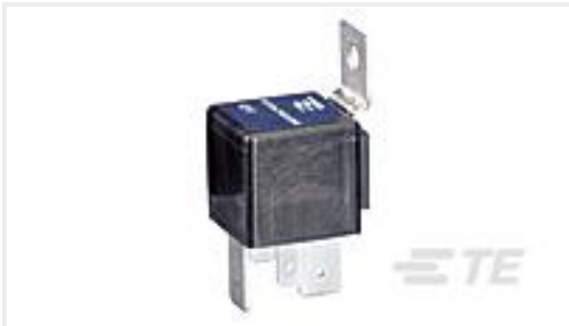
TE Part #1-1393304-1 V23134J1053D642-EV-CBOX