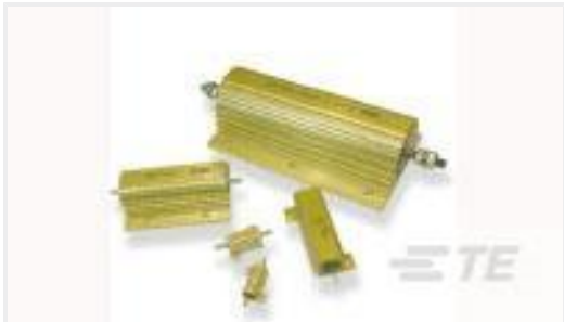
TE Part #1-1625999-4 HSC100 1R0 5%