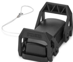
Protective cover B16, with double locking latch, protective cover material: PC, height: 26.4 mm, seal: yes

Please be informed that the data shown in this PDF document is generated from our online catalog. Please find the complete data in the user documentation. Our general terms of use for downloads are valid.