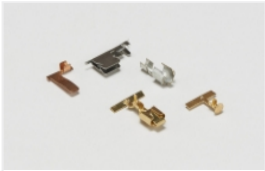
Special Purpose Terminals(1)