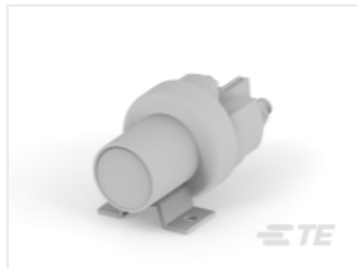
TE Part #K1008699 Relay 26-60-05