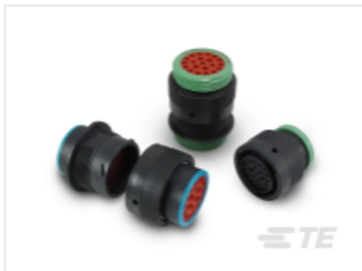
TE Part #CAT-H396-CH8172 DEUTSCH HDP20 Housings