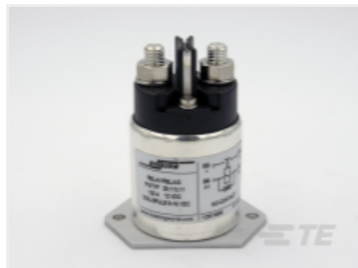
TE Part #K1060489 Relay 29-113-12