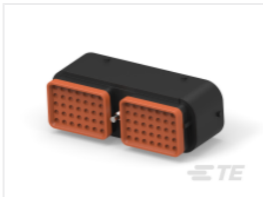
TE Part #DRC16-70SBE-P013UK PLG, 70P, BLK, E, SEAL BOND, B