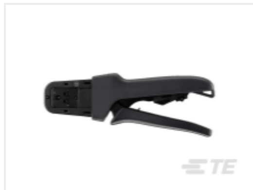
TE Part #DTT-20-03 CRIMP TOOL