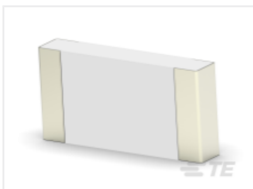
TE Part #2-2176245-2 CRGS1206 5% 56R