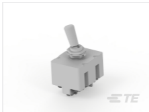
TE Part #K1002956 Toggle Switch 08-4-1-13