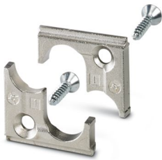
Adapter, application: Shield adapters

Please be informed that the data shown in this PDF document is generated from our online catalog. Please find the complete data in the user documentation. Our general terms of use for downloads are valid.