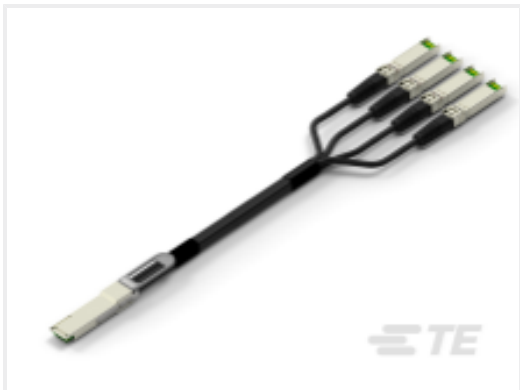
TE Part # CAT-C11-N490333 QSFP28-Four SFP+ Cable Assembly: 30 AWG