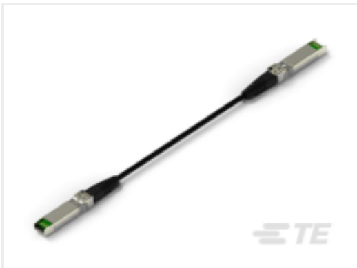
TE Part # CAT-C11-N49011 SFP28 to SFP28 Cable Assembly: 26 AWG