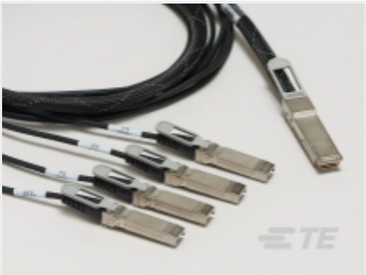
TE Part # 2821033-8 QSFP TO [4]SFP+, 28G, 1M, 33AWG

EU RoHS compliant have a maximum concentration of 0.1% by weight in homogenous materials for lead, hexavalent chromium, mercury, PBB, PBDE, DBP, BBP, DEHP, DIBP, and 0.01% for cadmium, or qualify for an exemption to these limits as defined in the Annexes of Directive 2011/65/EU (RoHS2). Finished electrical and electronic equipment products will be CE marked as required by Directive 2011/65/EU. Components may not be CE marked. Additionally, the part numbers that TE has identified as EU ELV compliant have a maximum concentration of 0.1% by weight in homogenous materials for lead, hexavalent chromium, and mercury, and 0.01% for cadmium, or qualify for an exemption to these limits as defined in the Annexes of Directive 2000/53/EC (ELV). Regarding the REACH Regulation, the information TE provides on SVHC in articles for this part number is based on the latest European Chemicals Agency (ECHA) ‘Guidance on requirements for substances in articles’ posted at this URL: https://echa.europa.eu/guidance-documents/guidance-on-reach