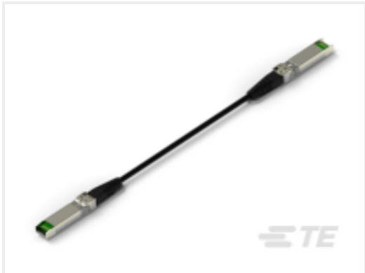
TE Part # 4-2821224-5 SFP56 DIRECT ATTACH CA, 3M, 26AWG