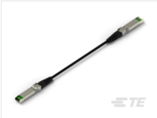
TE Part # 4-2334985-2 SFP56 DIRECT ATTACH CA, 1M, 32AWG