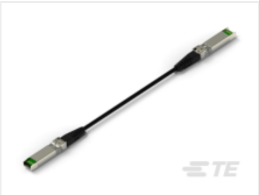
TE Part # CAT-C11-N4901114 SFP28 to SFP28 Cable Assembly: 30 AWG