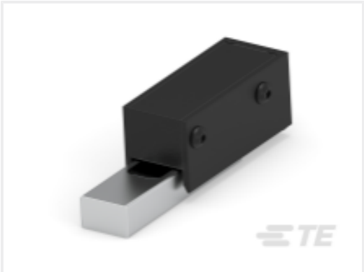
TE Part # 2215087-1 KIT, SEATING TOOL, 1X1 SFP+