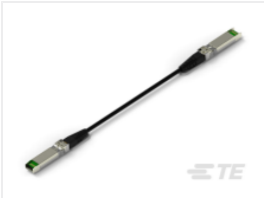
TE Part # 4-2821222-5 SFP56 DIRECT ATTACH CA, 2M, 30AWG