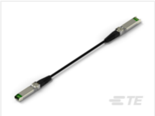
TE Part # 2334985-2 SFP28 DIRECT ATTACH CA, 1M, 32AWG