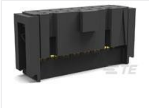
TE Part #1658527-7 622-1641LF FEM SOCKT,LEAD FREE