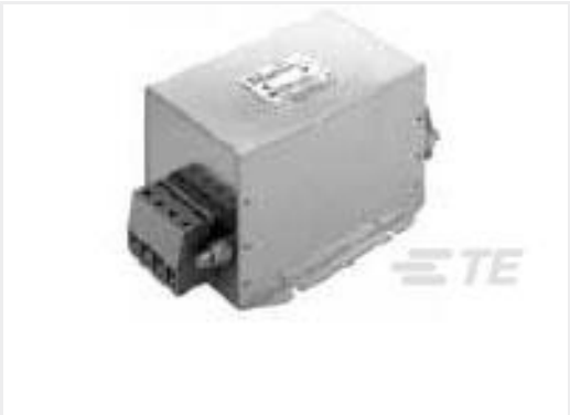
TE Part #6609067-3 63AYC10B=F7749D