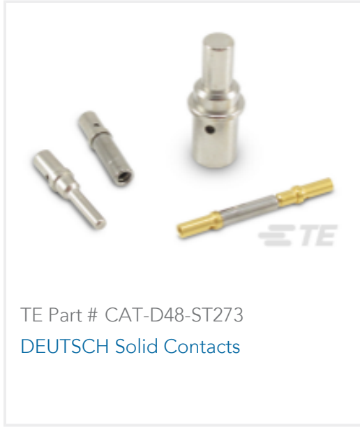
TE Part # CAT-D48-ST273 DEUTSCH Solid Contacts