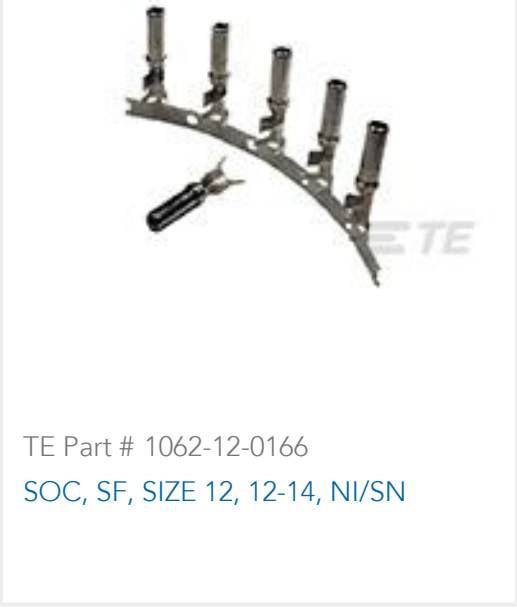
TE Part # 1062-12-0166 SOC, SF, SIZE 12, 12-14, NI/SN