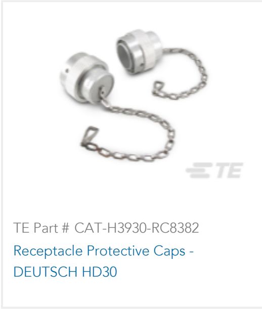
TE Part # CAT-H3930-RC8382 Receptacle Protective Caps - DEUTSCH HD30