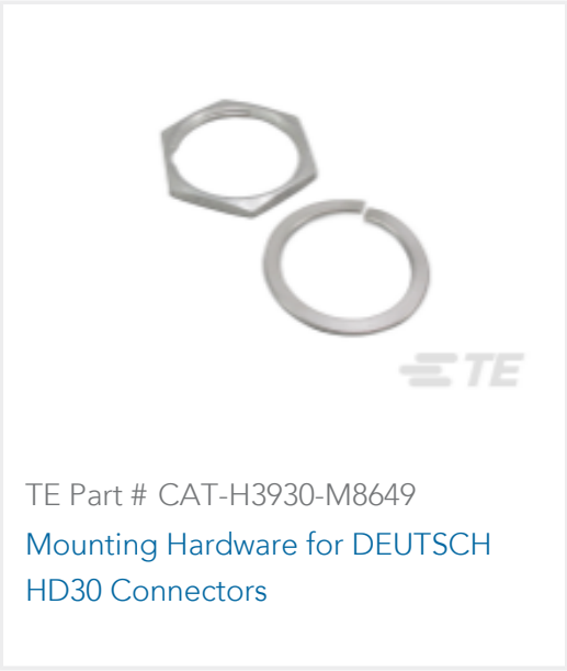
TE Part # CAT-H3930-M8649 Mounting Hardware for DEUTSCH HD30 Connectors