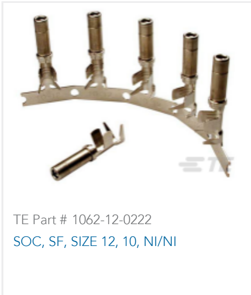
TE Part # 1062-12-0222 SOC, SF, SIZE 12, 10, NI/NI