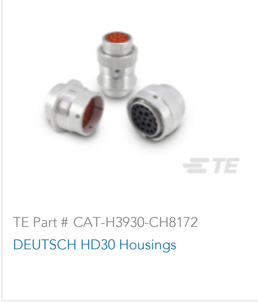
TE Part # CAT-H3930-CH8172 DEUTSCH HD30 Housings