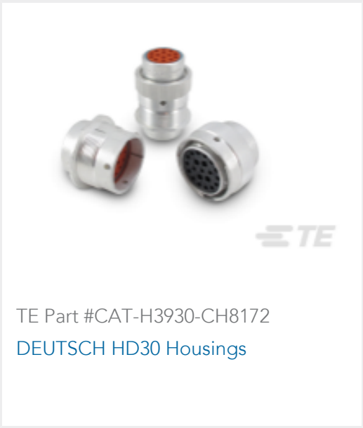
TE Part #CAT-H3930-CH8172 DEUTSCH HD30 Housings