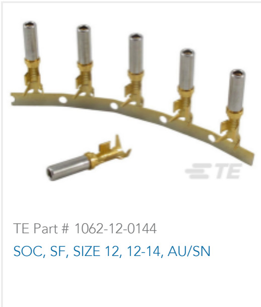
TE Part # 1062-12-0144 SOC, SF, SIZE 12, 12-14, AU/SN