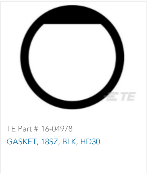
TE Part # 16-04978 GASKET, 18SZ, BLK, HD30