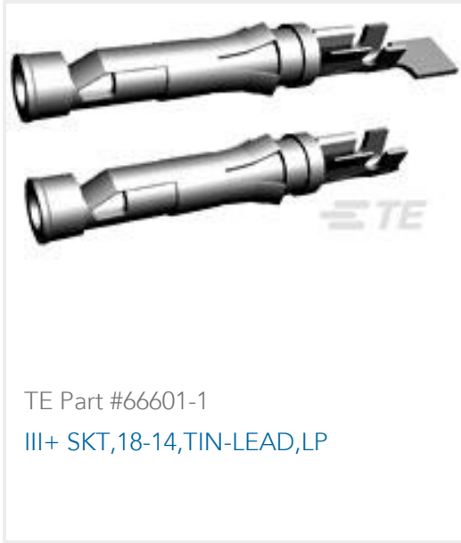
TE Part #66601-1 III+ SKT,18-14,TIN-LEAD,LP