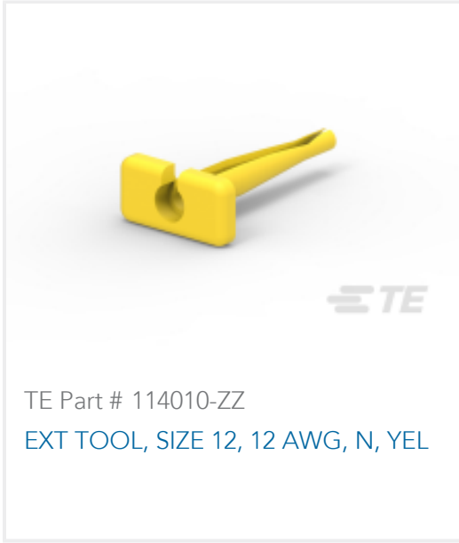
TE Part # 114010-ZZ EXT TOOL, SIZE 12, 12 AWG, N, YEL