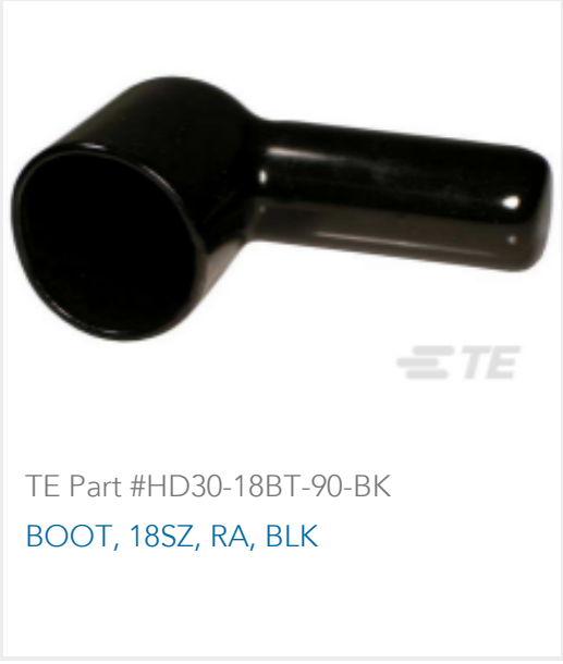
TE Part #HD30-18BT-90-BK BOOT, 18SZ, RA, BLK