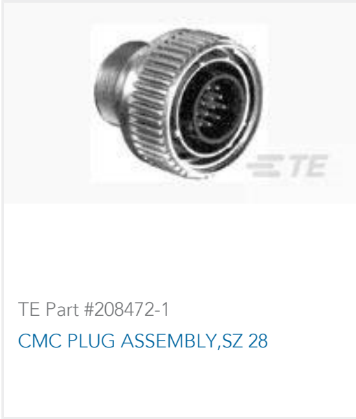
TE Part #208472-1 CMC PLUG ASSEMBLY,SZ 28