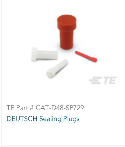
TE Part # CAT-D48-SP729 DEUTSCH Sealing Plugs