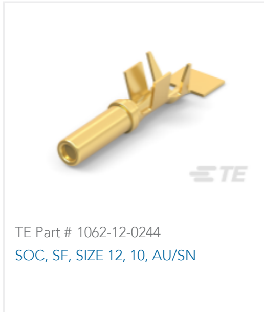
TE Part # 1062-12-0244 SOC, SF, SIZE 12, 10, AU/SN