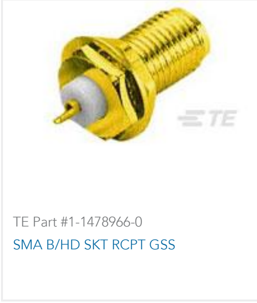
TE Part #1-1478966-0 SMA B/HD SKT RCPT GSS