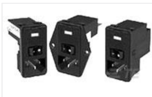
TE Part #7-6609107-0 PS0S0DS3A=C1182