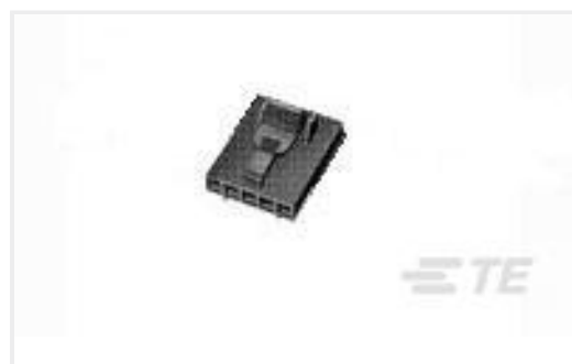
TE Part #1-104257-5 16 MTE RCPT HSG SR LATCH .100