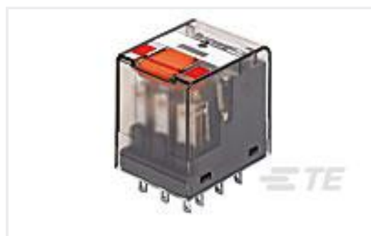
TE Part #8-1419111-4 PT570220