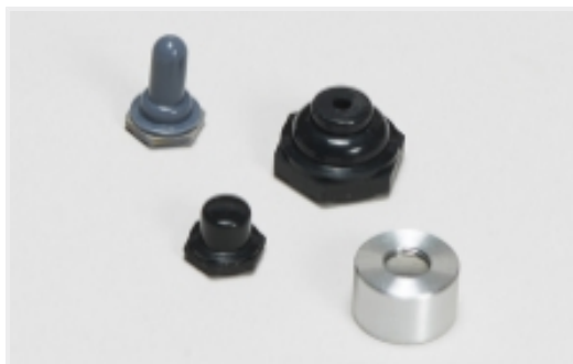
Switch Seals & Accessories(8)