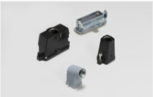
Rectangular Connector Hoods & Bases (1257)