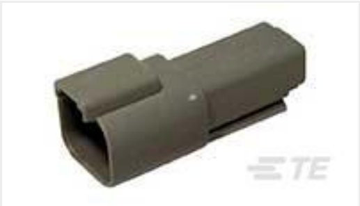
TE Part #DT04-2P REC, 2P, GRY, N