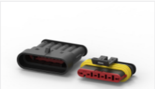
TE Part #CAT-AM71-CH8172 AMP SUPERSEAL 1.5MM, CONNECTOR HOUSING