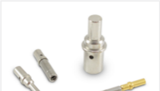
TE Part #CAT-D48-ST273 DEUTSCH Solid Contacts