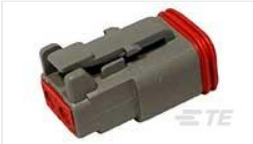
TE Part #DT06-2S PLG, 2P, GRY, N