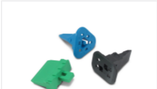
TE Part #CAT-D487-W416 Wedgelocks: DEUTSCH DT