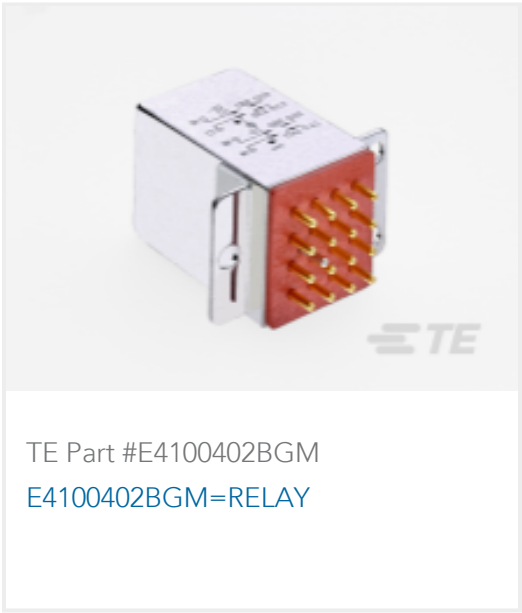
TE Part #E4100402BGM E4100402BGM=RELAY