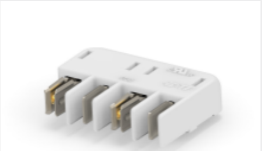
TE Part #2213616-2 HERM BLADE & RECPT,4 POS,POST,SEL GOLD