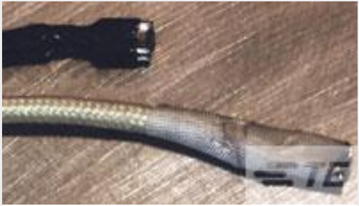
TE Part #7536494002 RT555-1/8-0-SP