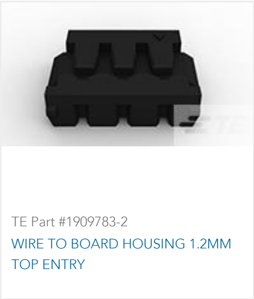
TE Part #1909783-2 WIRE TO BOARD HOUSING 1.2MM TOP ENTRY