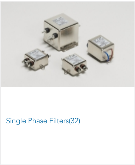
Single Phase Filters(32)