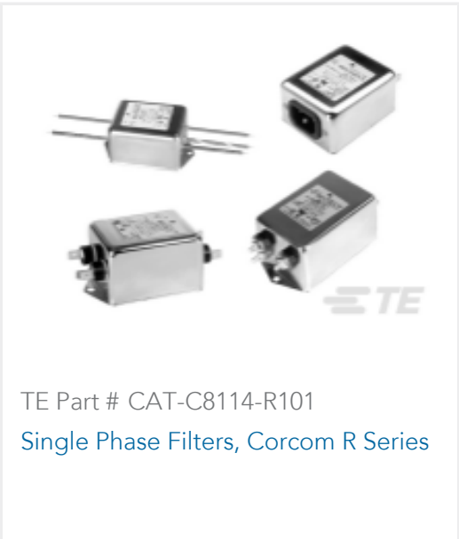
TE Part # CAT-C8114-R101 Single Phase Filters, Corcom R Series