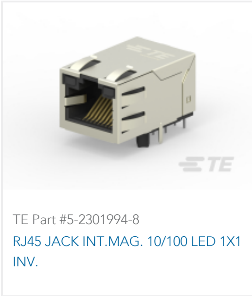
TE Part #5-2301994-8 RJ45 JACK INT.MAG. 10/100 LED 1X1 INV.