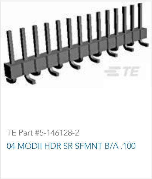
TE Part #5-146128-2 04 MODII HDR SR SFMNT B/A .100