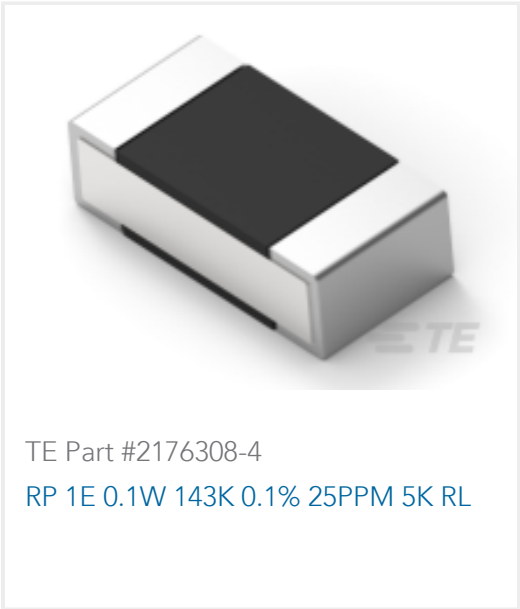
TE Part #2176308-4 RP 1E 0.1W 143K 0.1% 25PPM 5K RL