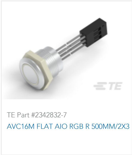
TE Part #2342832-7 AVC16M FLAT AIO RGB R 500MM/2X3