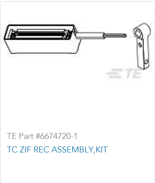
TE Part #6674720-1 TC ZIF REC ASSEMBLY,KIT