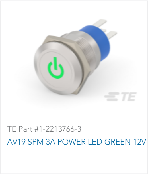
TE Part #1-2213766-3 AV19 SPM 3A POWER LED GREEN 12V