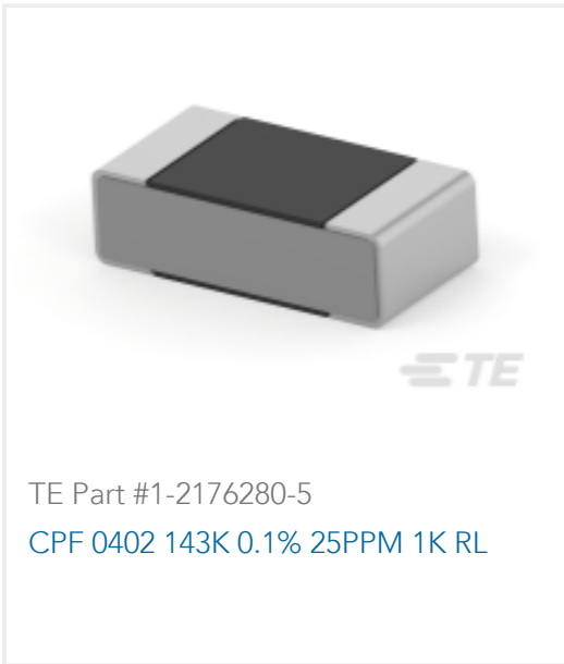
TE Part #1-2176280-5 CPF 0402 143K 0.1% 25PPM 1K RL