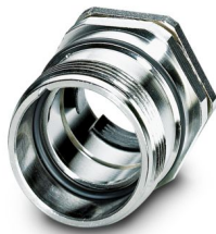
Panel mounting base, series: RC, straight, Screw locking mechanism, M23, Axial seal, Central fixing, shielded: yes

Please be informed that the data shown in this PDF document is generated from our online catalog. Please find the complete data in the user documentation. Our general terms of use for downloads are valid.