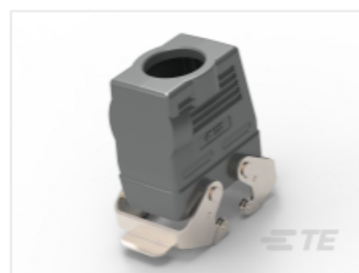
TE Part # T1280103129-000 H10B-TGBHS-PG29