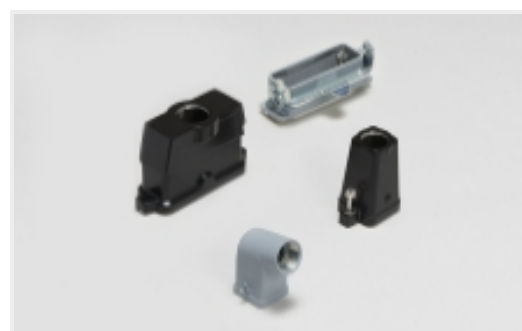
Rectangular Connector Hoods & Bases (1257)