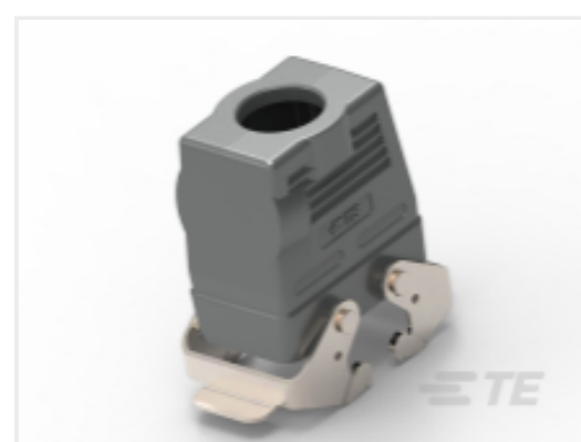
TE Part # T1280102129-000 H10B-TGBH-PG29