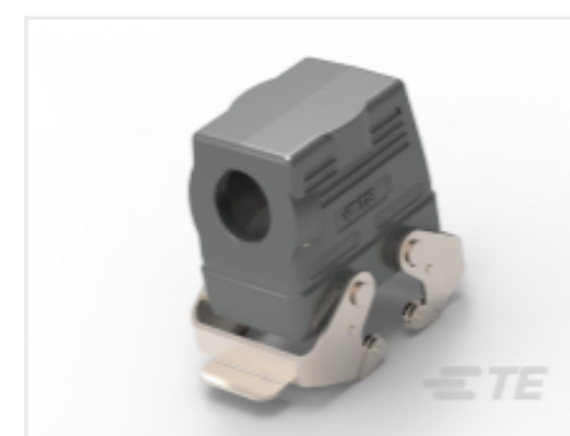
TE Part # T1250103121-000 H10B-TSBS-PG21