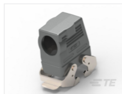
TE Part # T1270107134-000 H10B-TSBHS-NPT3/4