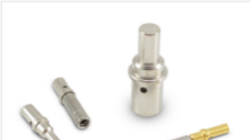
TE Part #CAT-D48-ST273 DEUTSCH Solid Contacts