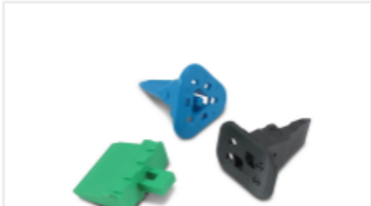
TE Part #CAT-D487-W416 Wedgelocks: DEUTSCH DT