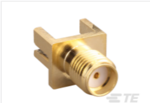
TE Part #L9000277-01 SMA Jack 50 Ohm .031 PCB Edge Mount