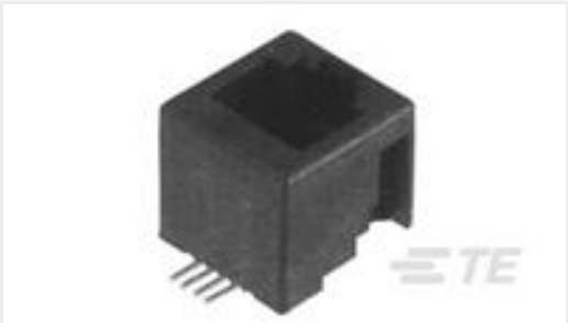
TE Part #1-338088-6 8/8 INV.MOD.JACK