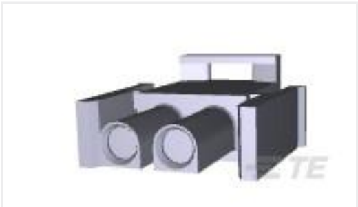
TE Part #1-350777-2 02P UMNL V0 PLUG HSG RED