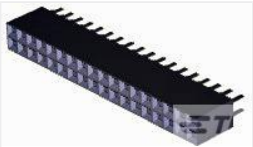
TE Part #1-534998-8 36 MODIV VRT DR CE 100/125