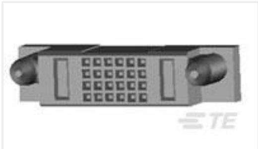
TE Part #6450540-1 MBXL VERT RCPT 1P+24S+1P