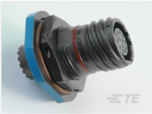
TE Part #YDTS24H13-35ZN0000 HERM RECP ASSY