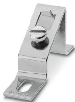
Angled brackets with M6 screw, DIN rail limit stop, for fixing DIN rails at an angle of 30°, with M6 screw, height: 35.4 mm

Please be informed that the data shown in this PDF document is generated from our online catalog. Please find the complete data in the user documentation. Our general terms of use for downloads are valid.