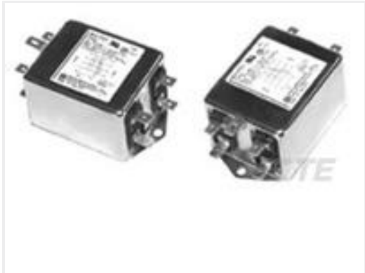
TE Part #6609066-2 6AYO1=F7692 S0