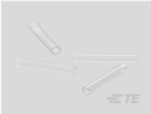
TE Part #NB17592001 RT-375-3/4-X-STK