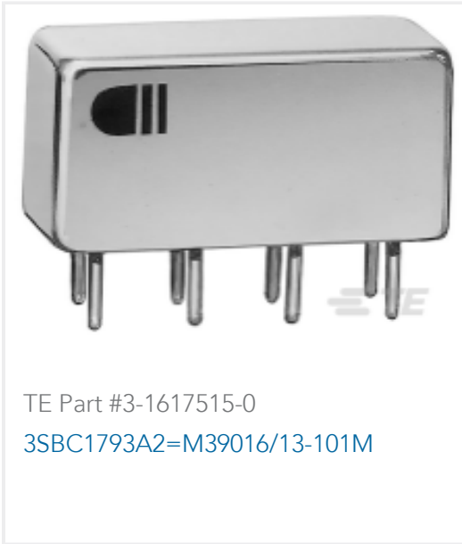
TE Part #3-1617515-0 3SBC1793A2=M39016/13-101M