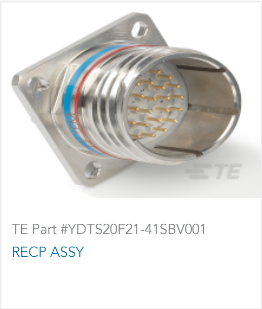
TE Part #YDTS20F21-41SBV001 RECP ASSY