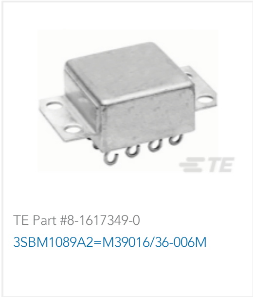
TE Part #8-1617349-0 3SBM1089A2=M39016/36-006M