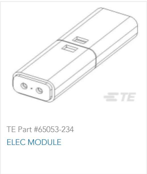
TE Part #65053-234 ELEC MODULE