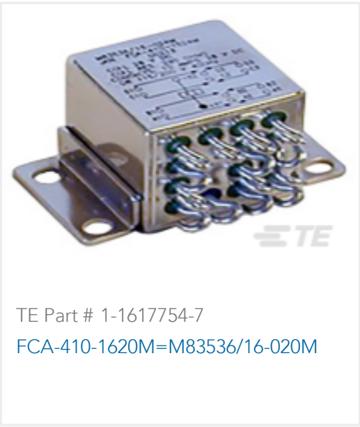
TE Part # 1-1617754-7 FCA-410-1620M=M83536/16-020M