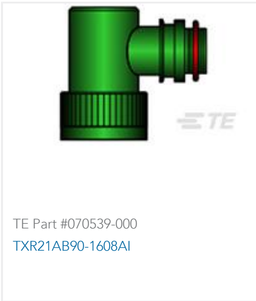
TE Part #070539-000 TXR21AB90-1608AI