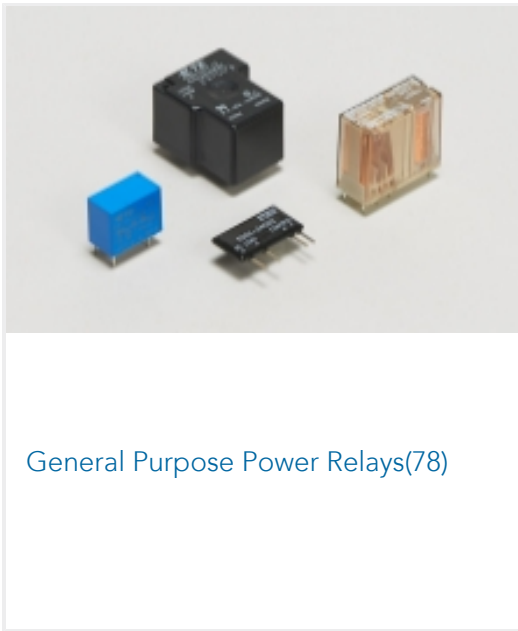
General Purpose Power Relays(78)