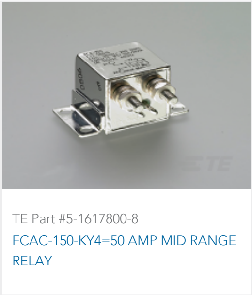
TE Part #5-1617800-8 FCAC-150-KY4=50 AMP MID RANGE RELAY