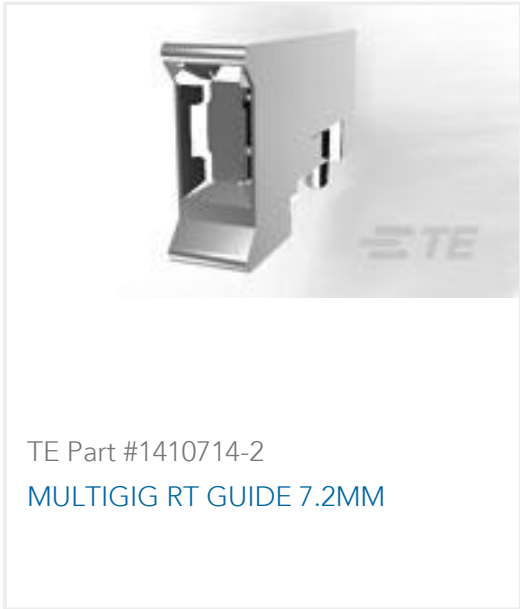
TE Part #1410714-2 MULTIGIG RT GUIDE 7.2MM