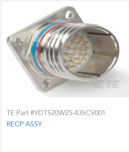
TE Part #YDTS20W25-43SCV001 RECP ASSY