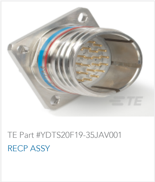
TE Part #YDTS20F19-35JAV001 RECP ASSY