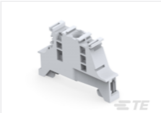
TE Part #1SNK900001R0000 BAM4