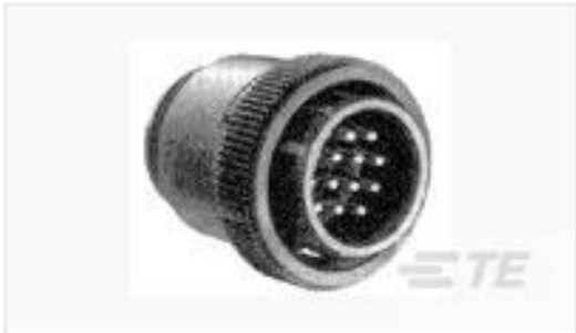
TE Part #206429-1 CPC PLUG ASSY, 11-4, REV SEX