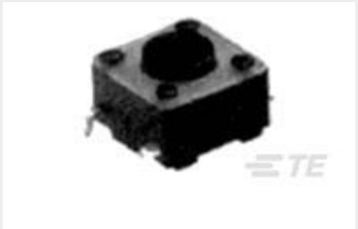
TE Part #5-1437565-0 FSM6JSMATR=TACT SWITCH 6X6MIL