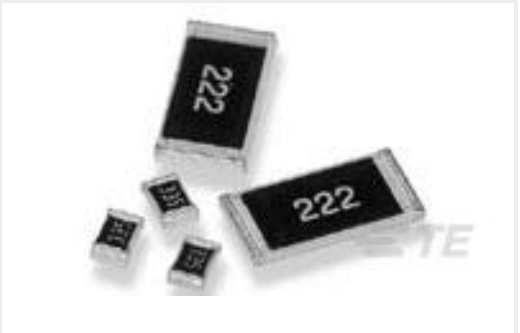
TE Part #6-1676480-9 CRG0402 1% 4K7