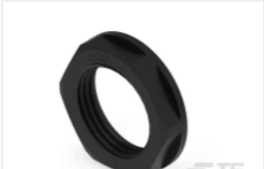
TE Part #1SNG607009R0000 EP-LN-M20-BL-A