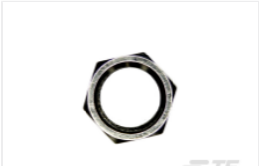
TE Part #NT-SMA-N Nut Nickel SMA Connectors RoHS