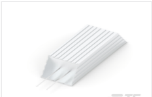
TE Part #2176507-6 CJP 200W 1R5 5% Lead