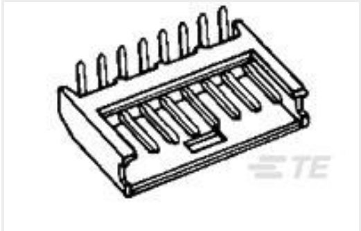
TE Part #280379-2 6P MODU II SHRD HDR, RT ANG, 0.38 AU