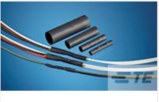
TE Part #5983226001 DSPL-NR2-0-50MM