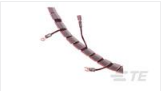
TE Part #500001-1 SPIRAP 1/4" PE, NAT, 50 FT