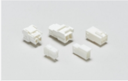
Rectangular Power Connectors(54)