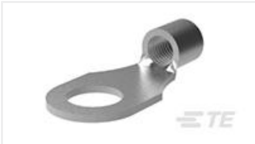
TE Part #320383 TERMINAL,SOLIS R 2 1/4