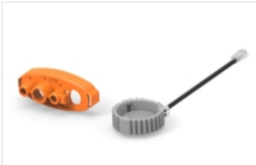
Connector Caps & Covers(11)