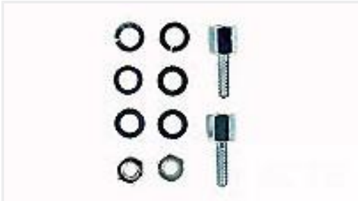
TE Part #5207872-1 KIT SCREWLOCK FEMALE (METRIC)