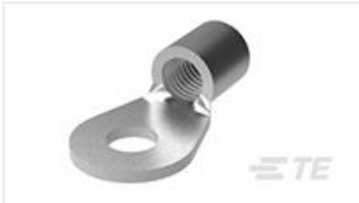
TE Part #33467 TERMINAL,SOLIS R 6 3/8