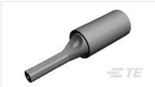
TE Part #8-165049-2 PIDG WIRE PIN - ASI