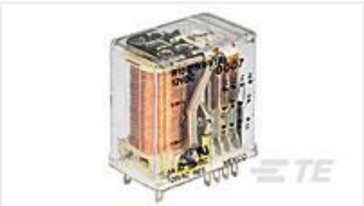
TE Part #7-1393765-4 R10-E1P4-V185=R10