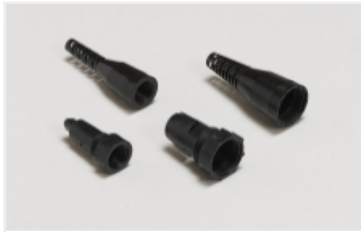
Connector Strain Relief(11)