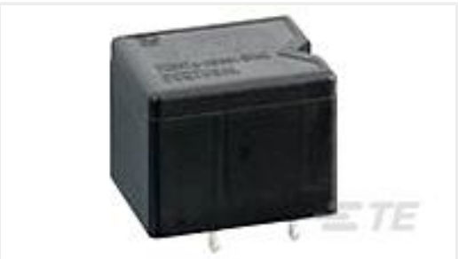
TE Part #1393277-4 V23076A1001C133