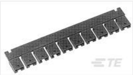
TE Part #2-382811-1 SHUNT, ECON, PHBRN, BLACK