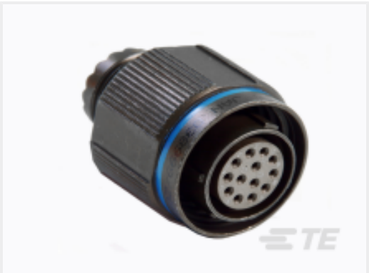
TE Part #YDTS26F15-97JNV001 PLUG ASSY