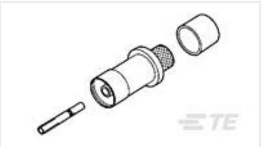
TE Part #225831-3 KIT,ARINC COAXICON SOCKET,SZ 1