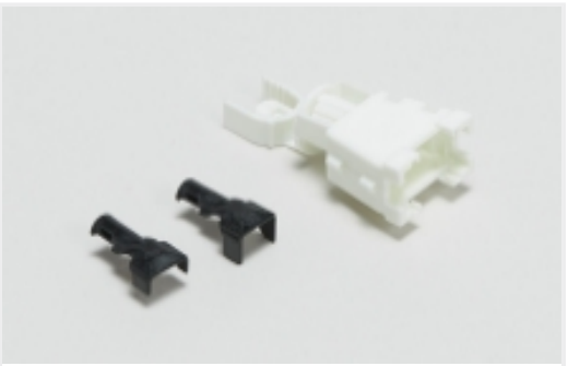
Rectangular Backshells & Clamps(2)