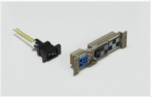
Rack & Panel Connectors(25)