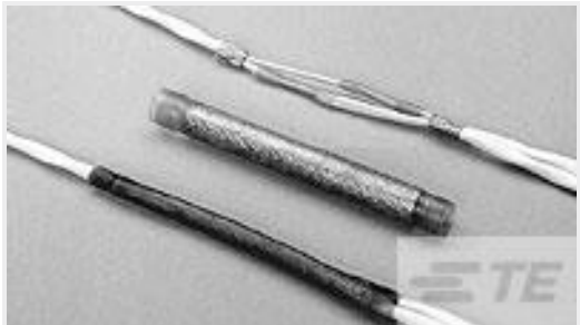
TE Part #748703-000 B-500-02-105