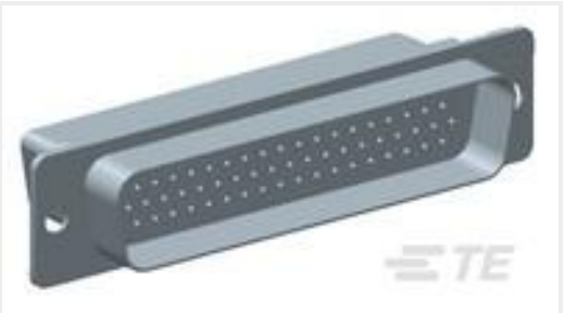
TE Part #2101497-5 AMPLIMITE KIT,PLUG,W/IF+GMT,Sz5, 90