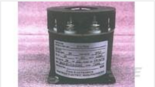
TE Part #1616103-2 DH7MN (FAA/PMA)=RELAY