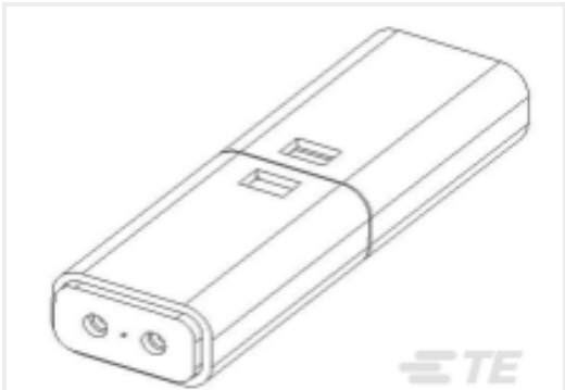
TE Part #65053-208 ELEC MODULE